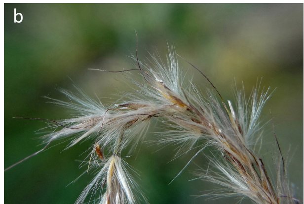
Fig.1 Miscanthus sinensis in the vicinity of the village Kovači near Zavidovići: a – habitat b – inflorescence