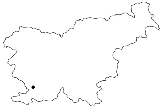
Fig. 2. Localization of the noted occurrence of Q. banatus within Slovenia.

The first noted locality (coordinates 45°39.9580' N, 13°59.4780' E, ± 10 m) is situated in the natural bridge between the collapse dolines Velika dolina and Mala dolina. Two young trees (Fig. 3) grow here directly at the left side of the tourist trail on the upper part of steep slope of the Velika dolina, somewhat below the splitting-up of the trail to the village of Škocjan and the Information Centre of the Škocjan Caves Regional Park.